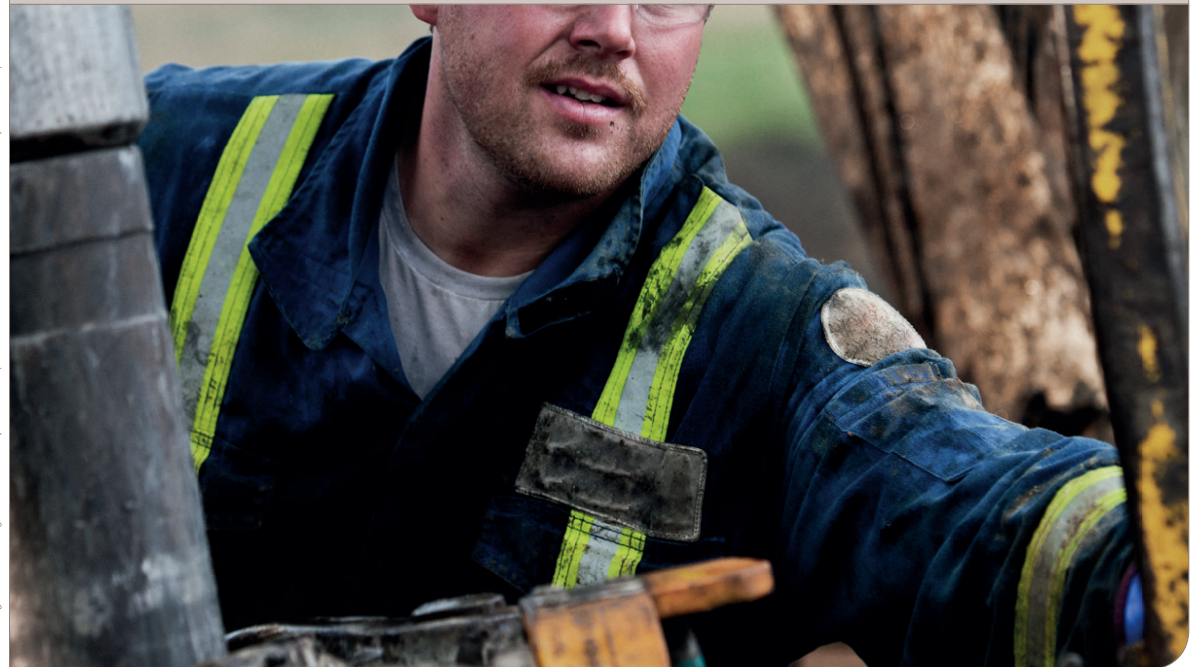
Alfa Laval is a global trademark registered and owned by Alfa Laval Corporate AB. Alfa Laval DuroCore is a trademark owned by Alfa Laval Corporate AB.

Alfa Laval DuroCore high-pressure offshore compression cooler