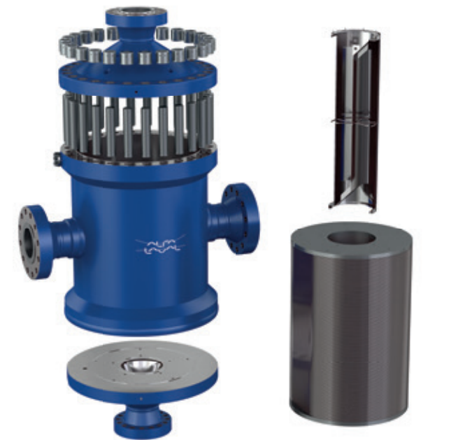
Accessing the core of the Alfa Laval DuroCore for maintenance and inspection is easy.