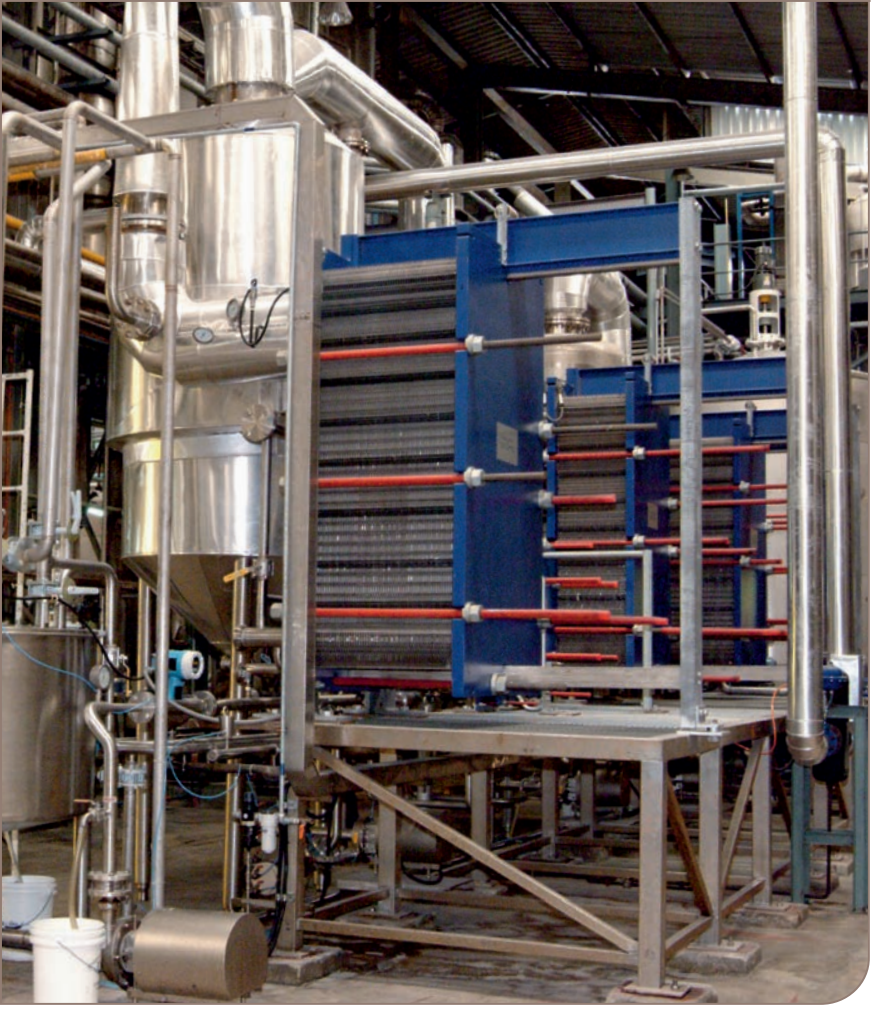
Three-effect AlfaVap plate evaporator system for fructose installed at Thai Glucose Co. Bangkok.

Thai Glucose Co., Ltd., Bangkok, Thailand, is a manufacturer of glucose syrup (super high maltose syrup, high maltose syrup, maltose syrup, low DE maltose syrup), fructose syrup, and dextrose monohydrate.