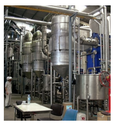
Two-effect AlfaVap plate evaporator system for dextrose and maltose.

accurate temperature control and, thus, high product quality.