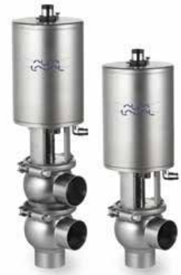
Alfa Laval Unique Single Seat Valve

Always keep Alfa Laval spare rubber seals in stock to avoid unplanned downtime.