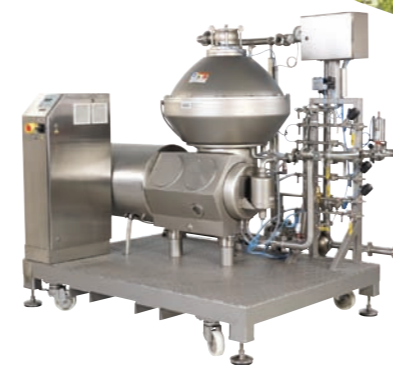
Clara Fully hermetic separators for juice clarification and wine or vinegar polishing