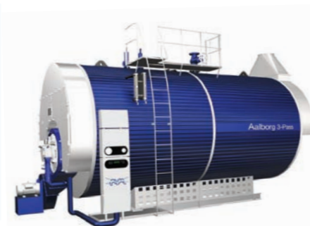
Boilers Fired and waste heat recovery boilers for hot water and steam