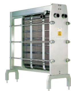
BaseLine, FrontLine Thermal modules for traditional or continuous tartaric stabilization, juice cooling with plate heat exchanger technology