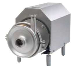
LKH, SRU, Solid-C, etc. Centrifugal and lobe pumps with food grade certifications