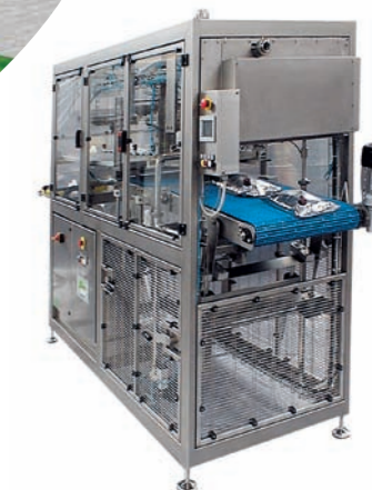
Alfa Laval Astepo Automatic and semi-automatic bag-in-box filler