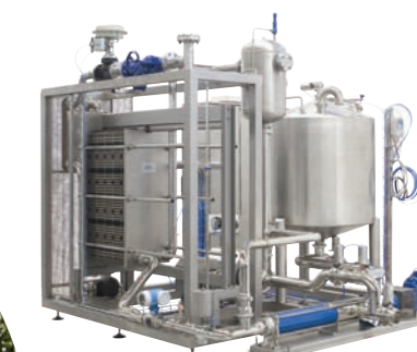
AlfaTherm Juice, wine or vinegar pasteurizer