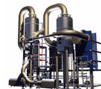
AlfaVap/AlfaFlash Evaporators for grape juice with or without previous stabilization, including desulfiter