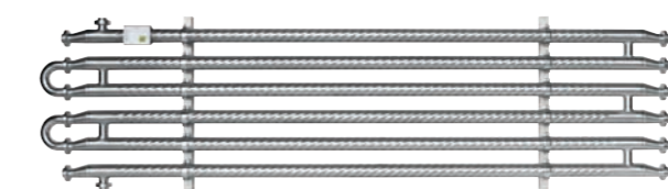
Alheat/Alcool Thermal modules for thermovinification and mash cooling with tubular or ohmic technology