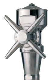
Iso-Mix Solution for blending and fining