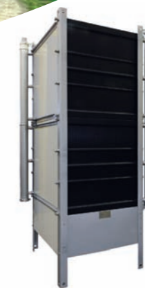
Membrane bioreactors and decanter centrifuges Solutions for byproducts and waste water treatment